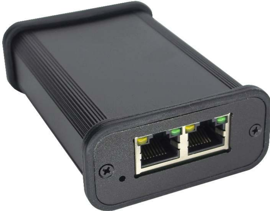
Figure 1: E1 side of icE1usb

From left to right, there are the following connectors: